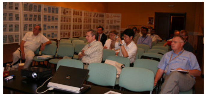
From the commission meeting