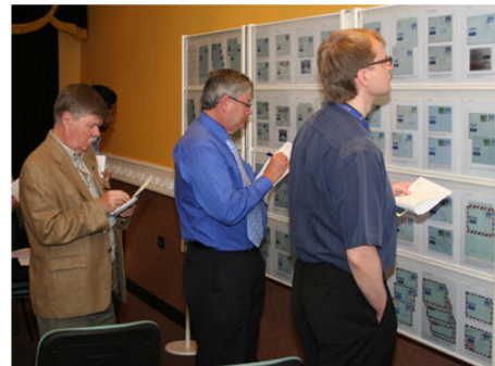
From the postal stationery seminar at EFIRO